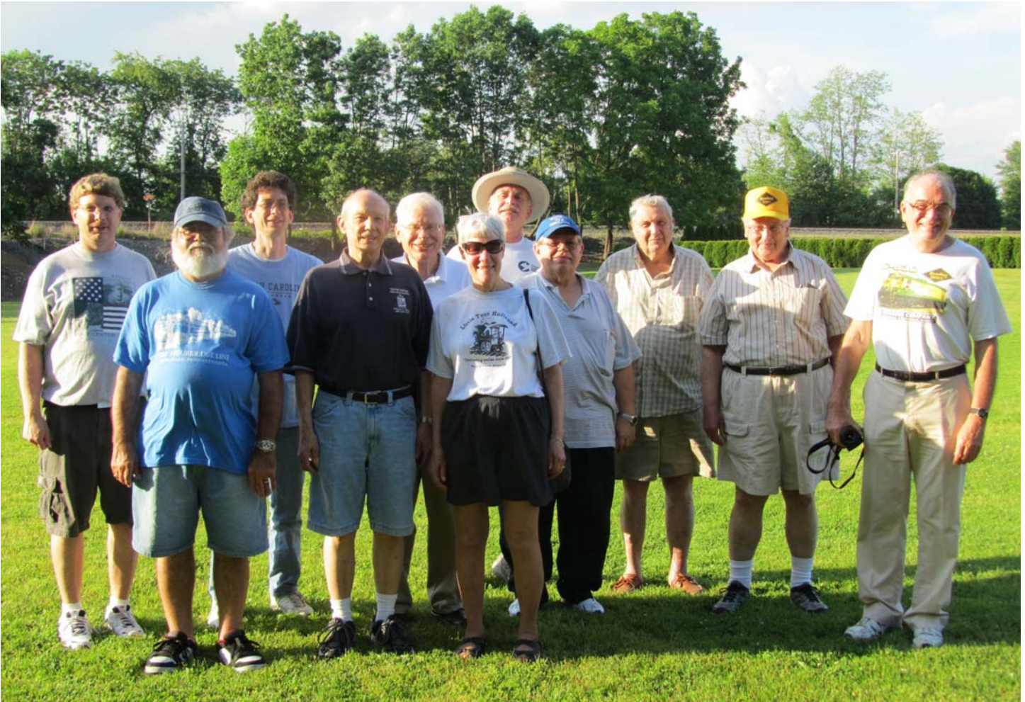
May 28, 2011: P&R Chapter Members pose for a picture during PicnicRAIL, at Maier's Grove, Blandon.